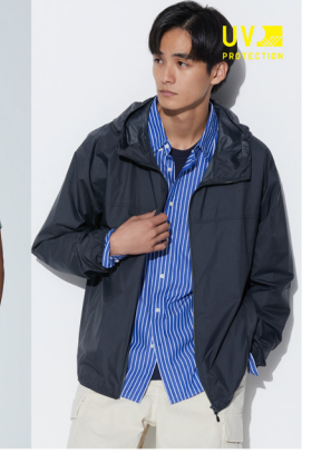
Pocketabe UV Protection Parka $49.90 $39.90