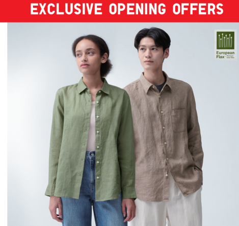
WOMEN + MEN 100% Premium Linen Shirt