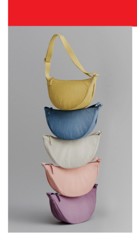
Round Mini Shoulder Bag <del>$19.90</del> $14.90

*Restrictions apply. Online orders containing alterations may be subject to longer delivery times. See terms and conditions for full details. **Dates differ per location. For Tacoma Mall, shop online between 4/29-5/5 and pick up 5/10-5/12. For Alderwood, shop online between 5/6-5/12 and pick up 5/17-5/19.