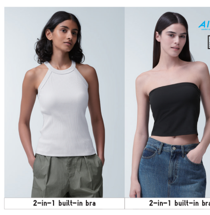
Halter Neck Bra Sleeveless Top <del>$29.90</del> $19.90