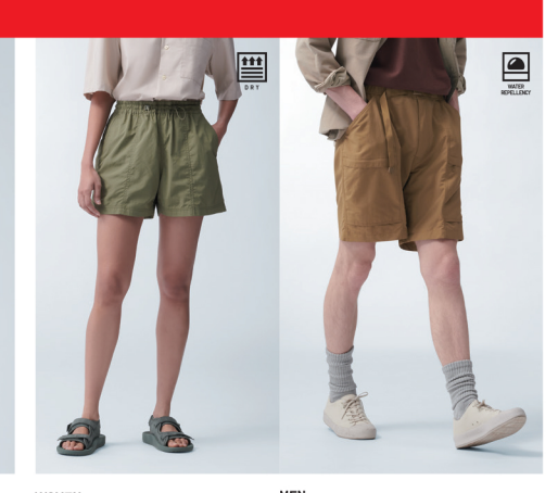
Parachute Shorts $39.90 $29.90