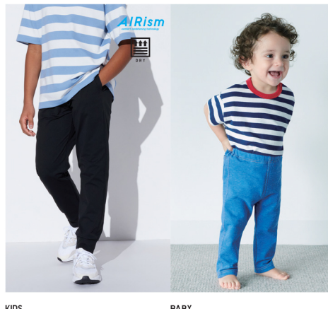
Ultra Stretch AlRism™ Jogger Pants $24.90 $19.90